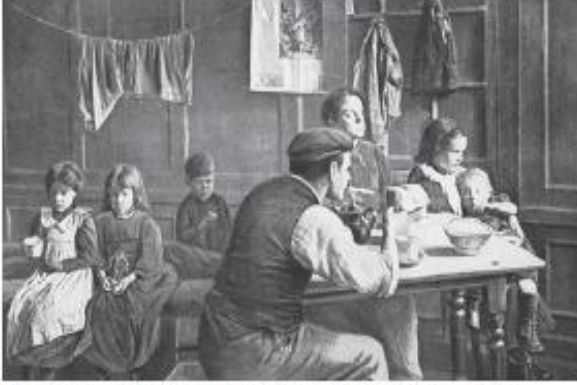
Before the war, most British women stayed at home, did the cooking and cleaning and cared for the children. When their husbands came home from work, they prepared the family supper.