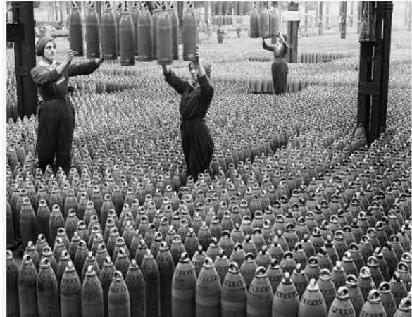
Female munitions workers guide 6-inch howitzer shells being lowered to the floor at the National Shell Filling Factory in Chilwell, Nottinghamshire in July 1917