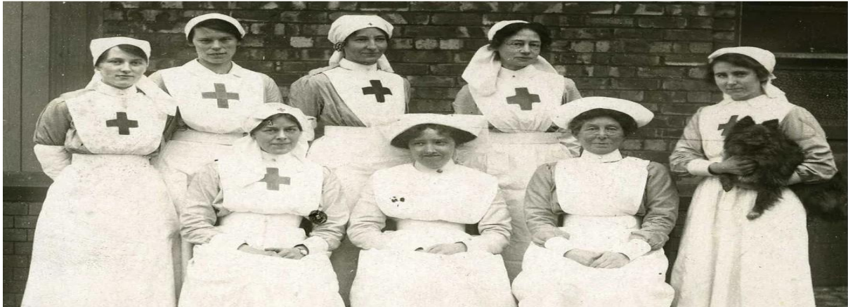
British Red Cross volunteer nurses outside Bramhall and Cheadle Hulme Hospital, First World War, 1914-1918